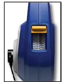
Large Sliding Door